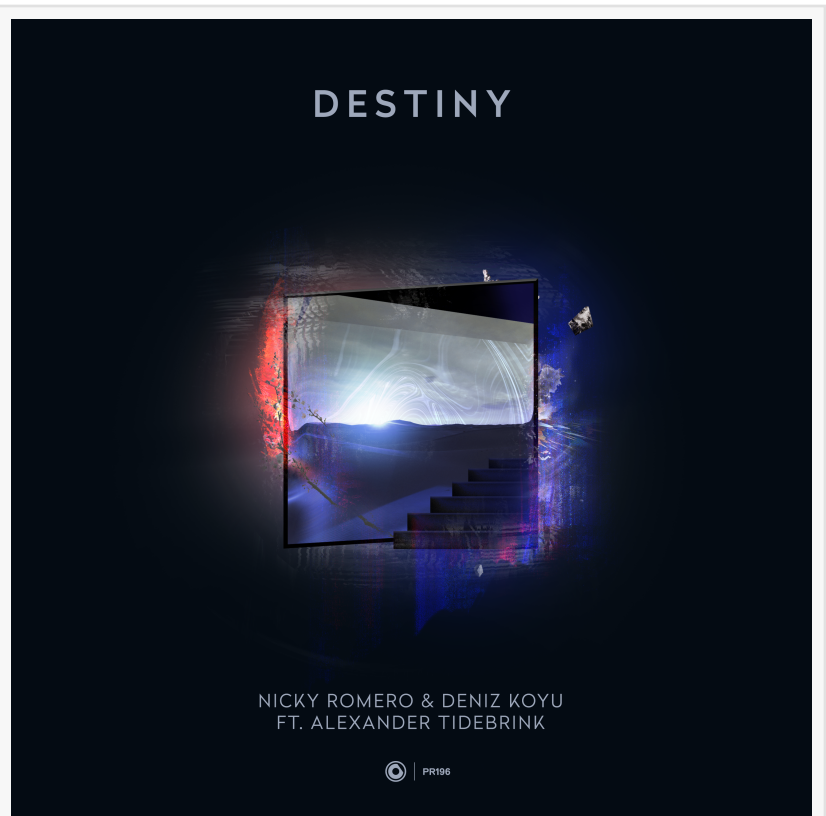
Nicky Romero & Deniz Koyu - Destiny

More Nicky Romero & Deniz Koyu on HIP Video Promo