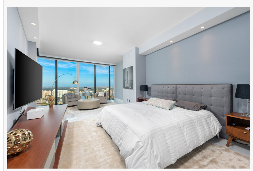
Porsche Design Tower, Residence 4603