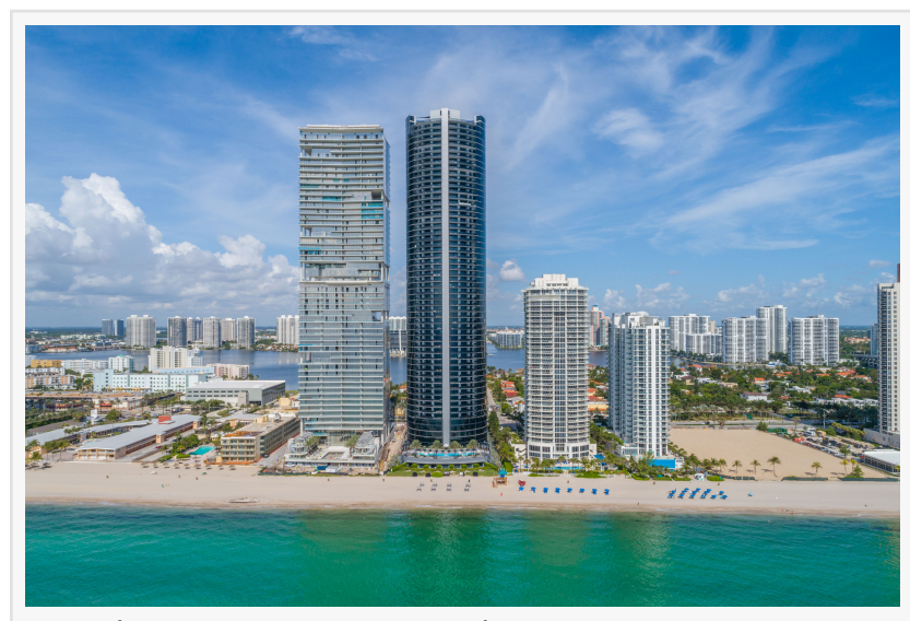
Porsche Design Tower, Residence 4603

NEW YORK, NEW YORK, UNITED STATES, July 31, 2020 /EINPresswire.com/ -- Located minutes from affluent Multi-Million Dollar Row on the 46th floor with miles of waterfront views, Residence 4603 in the coveted Porsche Design Tower will auction online turnkey furnished next month via Concierge Auctions in partnership with top luxury agent Billy Nash of Nash Luxury at Illustrated Properties. Previously offered for $4.45 million, the property will sell No Reserve to the highest bidder. Bidding will be held August 28th–31st via