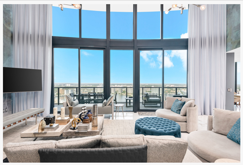
Porsche Design Tower, Residence 4603