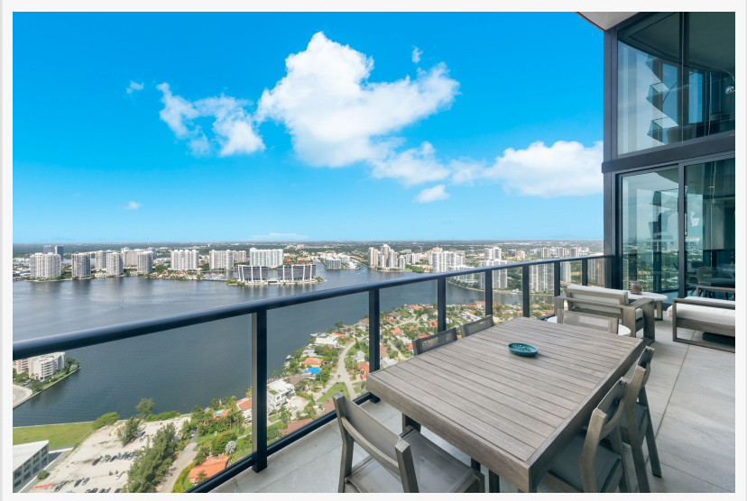
Porsche Design Tower, Residence 4603

Located in South Florida, Sunny Isles Beach is the epitome of a beach-adjacent southern oasis