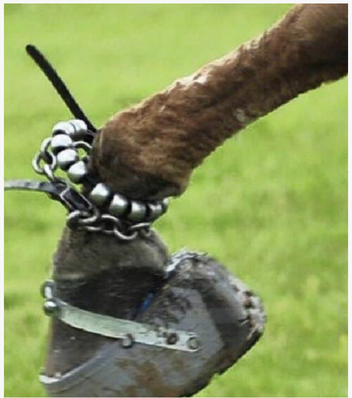
'Big Lick' stacked shoe and chains