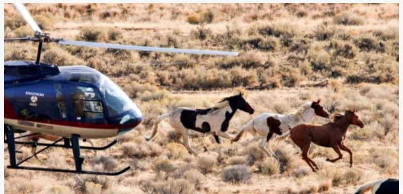
BLM Wild Horse Helicopter Roundup

The amendment directs the BLM to use those dollars to implement humane fertility control within the wild horse and burro populations. Using the funding for Porcine Zona Pellucida (PZP) would prevent the money from being utilized for inhumane helicopter roundups, mass holding of horses in government-run facilities, and highly invasive and painful surgical sterilization in the field, often conducted in sweltering heat. Each horse in government holding costs the taxpayer $1,600 per year, and even the BLM Acting Director William Perry Pendley has said the agency's massive