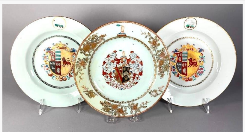
Three beautiful Chinese Export armorial plates, both Qing, Quianlong (circa 1735-1745), both painted in the center with coats of arms ($1,599).

The Modern auction will feature many other wonderful finds in the fine art category, to include works by artists like Viktor Schreckengost, Julian Stanczak and others. Cataloging is underway. Furnishings will showcase some excellent Mid-Century Modern classics from names such as