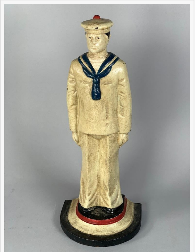
Lot 182 was a hand-painted cast iron door stop in the form of a uniformed sailor, painted in red, white and blue and standing 13 ½ inches tall ($1,169).

EIN Presswire's priority is source transparency. We do not allow opaque clients, and our editors try to be careful about weeding out false and misleading content. As a user, if you see something we have missed, please do bring it to our attention. Your help is welcome. EIN Presswire, Everyone's Internet News Presswire™, tries to define some of the boundaries that are reasonable in today's world. Please see our Editorial Guidelines for more information.