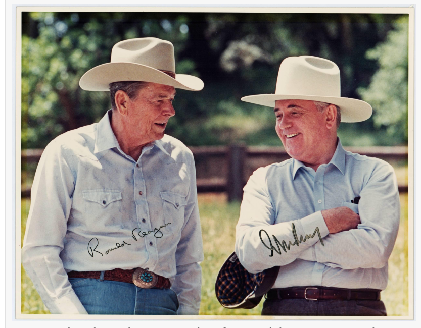
Original color photograph of Ronald Reagan and Russian leader Mikhail Gorbachev, showing the two men wearing Western hats in an outdoor setting, signed by both (est. $3,500-$4,000).

Literary collectors will be interested in two unusual guns previously owned by author Ernest Hemingway. One of them is a circa mid-19th century North African brass-decorated Kabyle musket