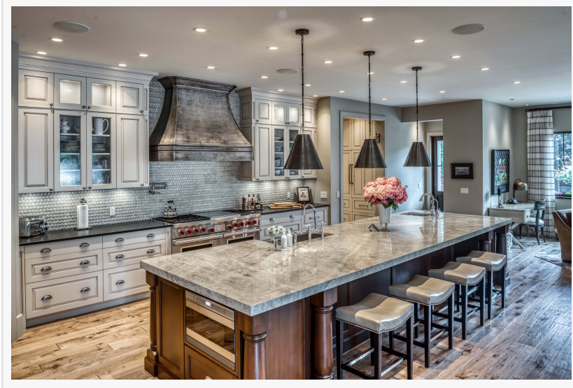
Chef's kitchen with island

About Concierge Auctions Concierge Auctions is the largest luxury real estate marketplace in the world, powered by state-of-the-art technology. Since its inception in 2008, the firm has generated billions of dollars in sales, broken world records for the highest-priced homes ever achieved at auction, and is active in 40 U.S. states/territories and 29 countries. Concierge curates the most prestigious properties globally, matches them with qualified buyers, and facilitates transparent, market-driven transactions in an expedited time frame. The firm owns the most comprehensive and intelligent database of high-net-worth real estate buyers and sellers in the industry. As a six-time honoree to the annual Inc. Magazine list of America's fastestgrowing companies, it now joins the Inc5000 Hall of Fame; was named No. 38 on the 2018 Entrepreneur 360™ List recognizing 360 small businesses every year that are mastering the art of and science of growing a business in the areas of impact, innovation, growth, leadership, and business valuation; and has contributed more than 200 homes to-date as part of its Key for Key<sup>®</sup> giving program in partnership