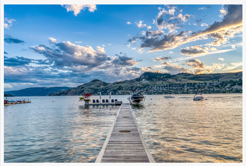
Twilight view of dock on Kalamalka Lake

with Giveback Homes™, which guarantees that for every property the company sells, a new