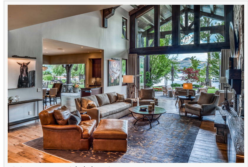
Living room with lake view

"We spent over four years building this home, and custom-designed it with both nature and gathering in mind for the ultimate lakeside retreat with impeccable craftsmanship and finishes not bound by time but rather sustainable and enjoyable for generations—soaring open fir beams framing expansive living areas, a spacious gourmet kitchen, and outdoor stone patio with abundant space for relaxing or hosting guests. All with glistening views of the Kalamalka Lake waters beyond," stated the seller.