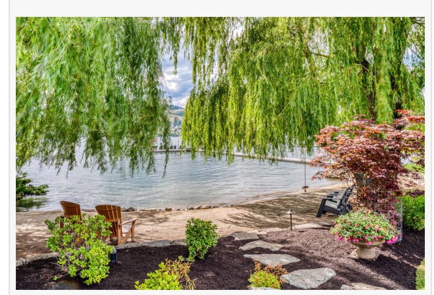
Sandy beach with seating