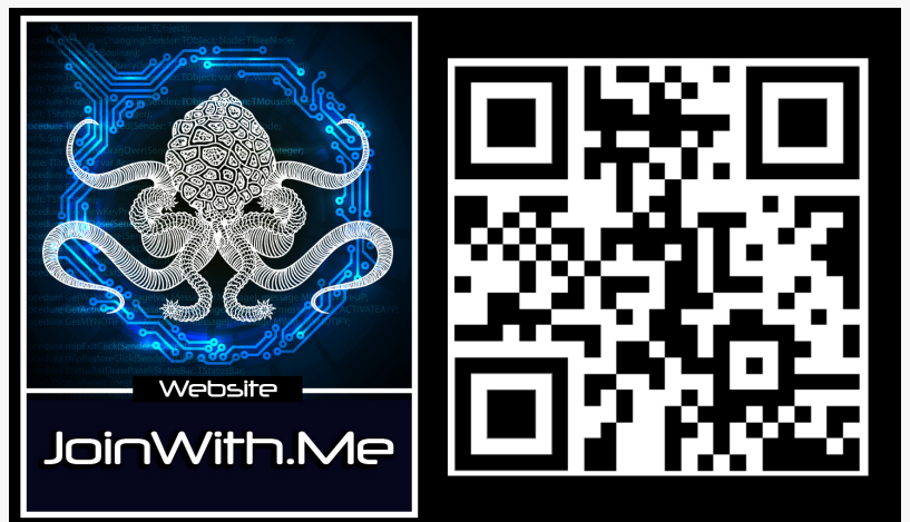
JoinWith.Me QR code that connects to the video trailer