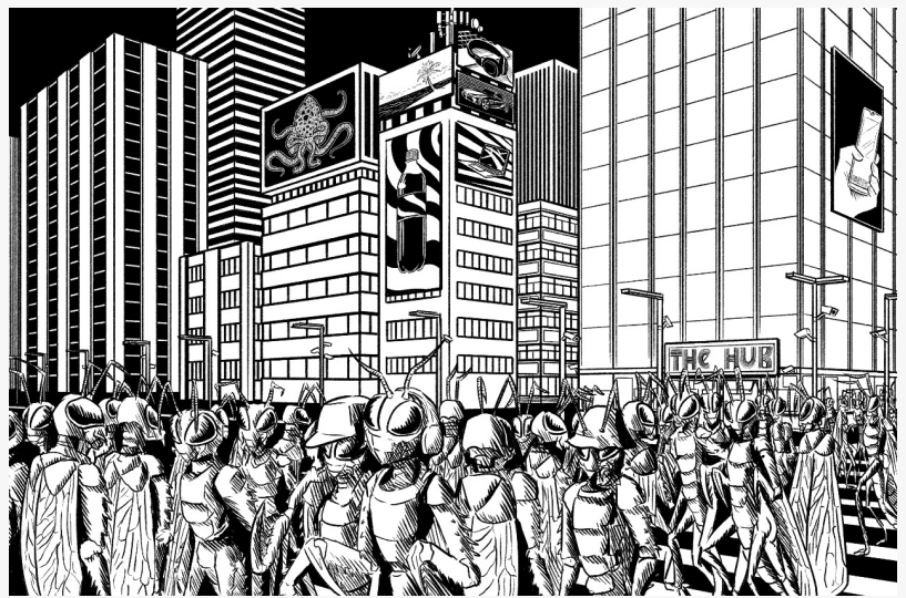
Storyboard image from JoinWith.Me, Sam's view of the City