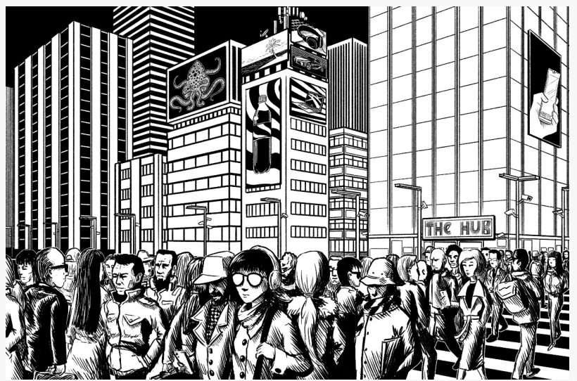
Storyboard image from JoinWith.Me, view of the City