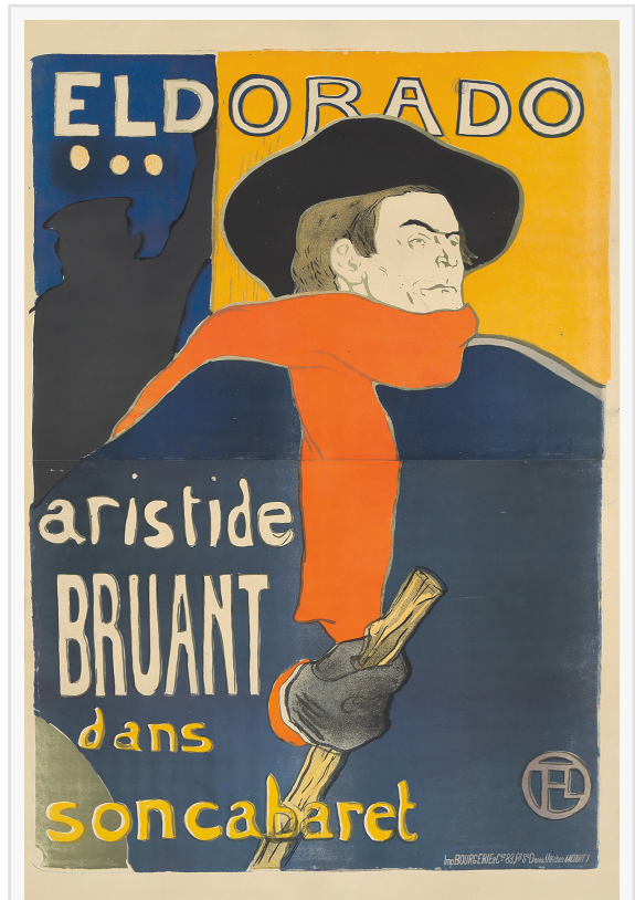
The great mythologizer of Montmartre, Henri de Toulouse-Lautrec, maintained his appeal to bidders. His 1894 Eldorado / Aristide Bruant changed hands for $78,000.

The zest for Art Nouveau works continued with Alphonse Mucha , whose ornate designs remain a staple for collectors. Two sets of his revered decorative panels for the four seasons claimed top sales: the 1896 set of The Seasons was won for $43,200; a rare variant with the imprint of L.