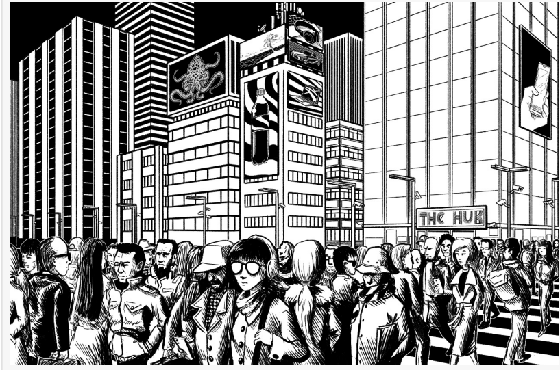
Storyboard image from JoinWith.Me, view of the City