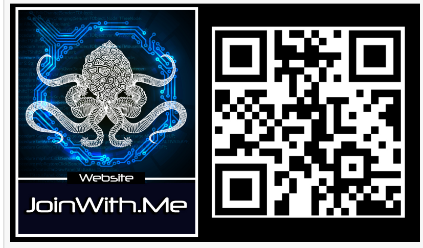
JoinWith.Me QR code that connects to the video trailer