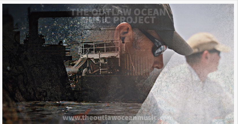
The Outlaw Ocean

This press release can be viewed online at: https://www.einpresswire.com/article/523390092