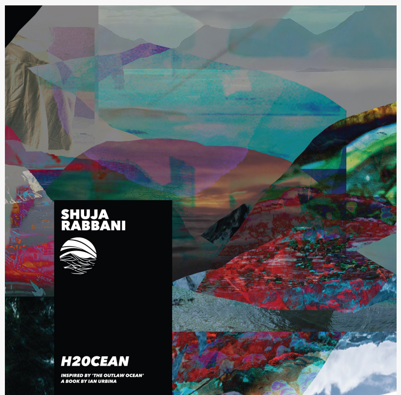
'H2Ocean' - Music inspired by The Outlaw Ocean book written by Ian Urbina.

DUBAI, DUBAI, UNITED ARAB EMIRATES, August 9, 2020 /EINPresswire.com/ -- "The Outlaw Ocean Music Project" is a first-of-its-kind collaboration which melds music and journalism. In combining their mediums, these narrators have conveyed emotion and a sense of place in an enthralling new way. The result is a captivating body of music based on original reporting in The Outlaw Ocean. Using a sound archive and inspired by the reporting, over 250 artists from more than 50 countries produce EPs in their own interpretive musical styles — be it electronic, ambient, classical or hip hop — and are released every other month.