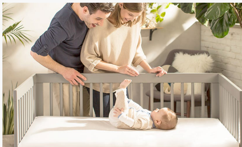
Naturepedic's GOTS-Certified Organic Baby Crib Mattress