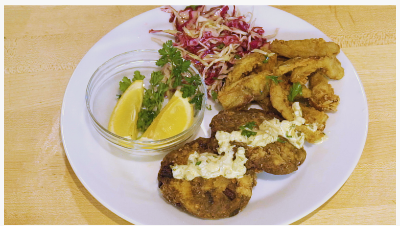
They look like fish cakes. But, it's jackfruit!

Official Sites: www.supportandfeed.com www.newdaynewchef.com