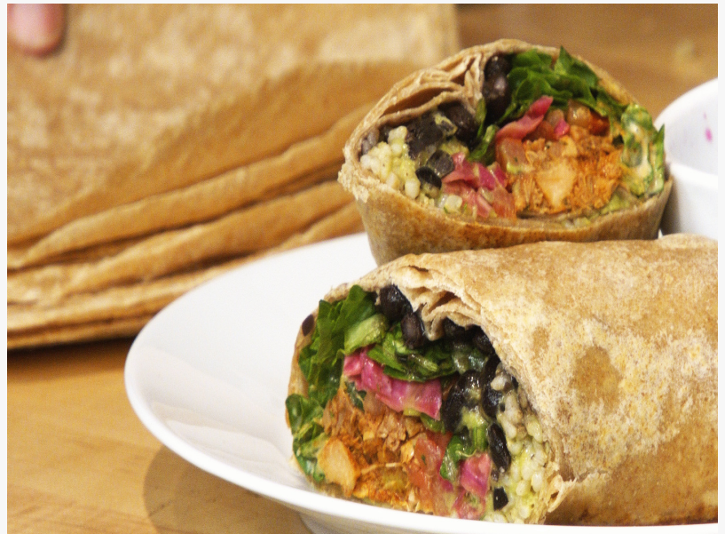
This is a classic burrito. But, the ingredients used, including jackfruit, make it highly nutritious.