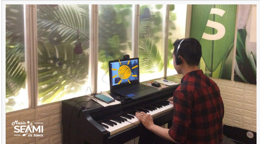
SEAMI is one of a few educational centers to offer online music classes with Vietnamese coaches.

As they lack an environment to acquire new words and interact with others, they cannot speak Vietnamese properly. And if they don't learn the language since birth, they will find it more and more challenging when growing up.