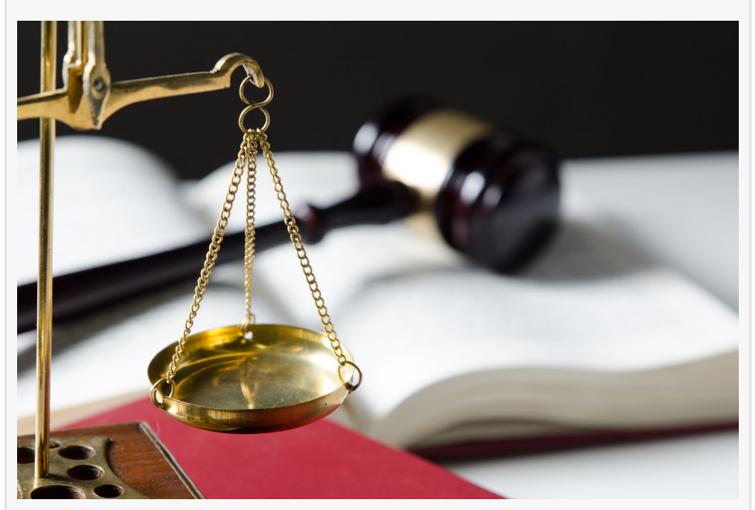
The Steinberg Law Group has the experiences, resources and results to obtain the maximum financial compensation for veterans