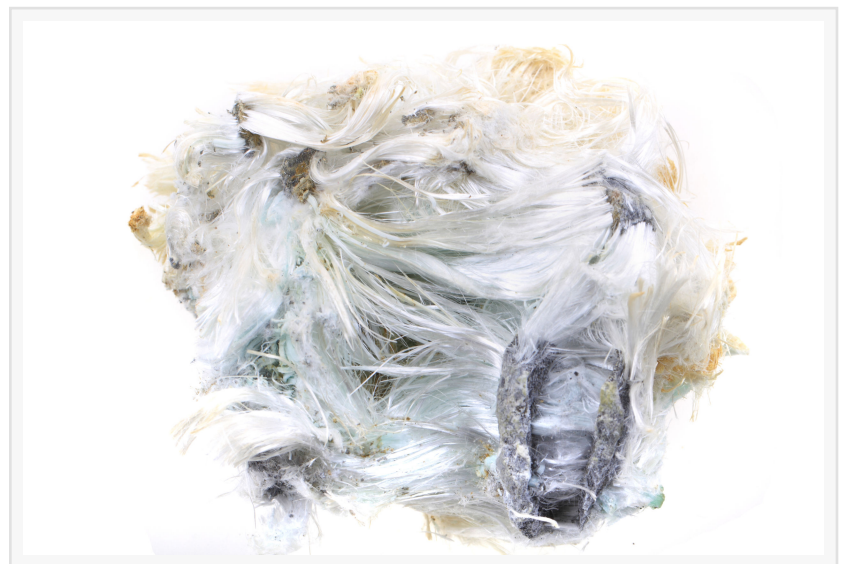
The asbestos industry knowingly poisoned people for decades.

The Mesothelioma Options Help Center of New York has endorsed The Steinberg Law Group because of their vast experience in handling mesothelioma and other asbestosrelated cases. With offices in New York, California and Texas, The Steinberg Law Group has a national footprint that helps win the best possible financial compensation for clients.