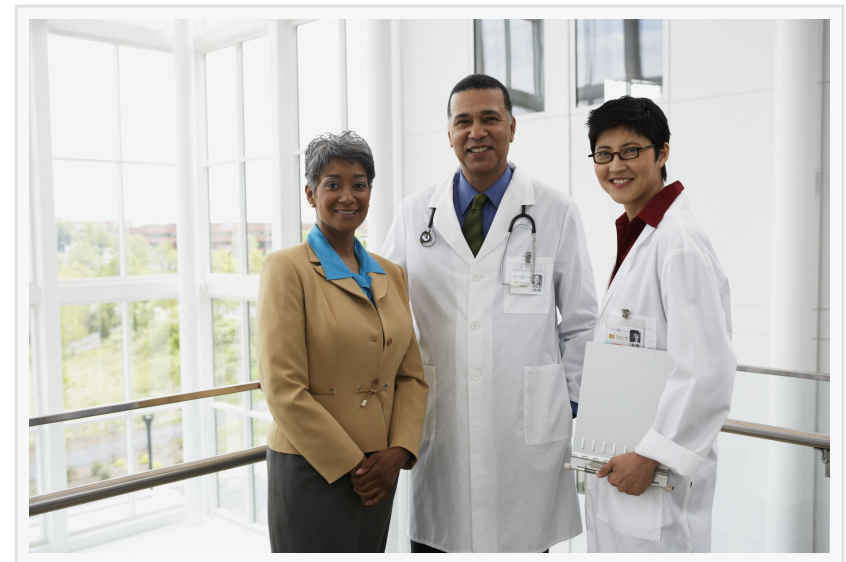
The Steinberg Law Group is affiliated with doctors around the country.

Known jobsites and companies with asbestos exposure in New York include, but are not limited to, General Motors, Albany Felt Company, Spaulding Fibre, Indian Point Energy Center, American Standard, Bethlehem Steel, Dunlop Tire and Rubber, Sumitomo Rubber, Ingersoll Rand, Carborundum Company, Niacet Corporation, Niagara Electrochemical Company, Occidental Chemical Company, Occidental Chemical Corporation, Union Carbine Company, American Cyanamid Company, Dresser-Rand, Palmyra, Garlock Sealing Technologies, Georgia Pacific