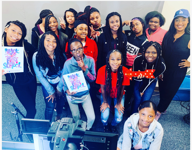
BGFS Students During a BGFS program

This press release can be viewed online at: https://www.einpresswire.com/article/523588085