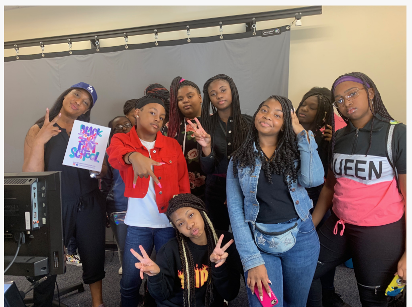
BGFS Students During a BGFS program

With such a pronounced goal, Jayda has been motivating film industry stakeholders and others that matter in making decisions relating to representation to indulge in an intentional effort to promote Black girls in the technical areas where they are grossly under-represented. As for her, she continues to create learning opportunities for black girls around the world by delivering BGFS’s programs online and via their very own learning mobile application.