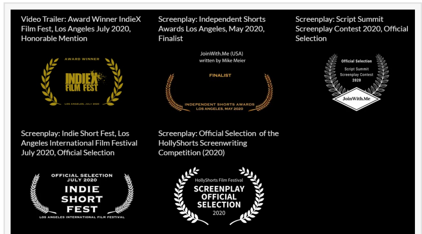
Recognition for JoinWith.Me trailer and screenplay