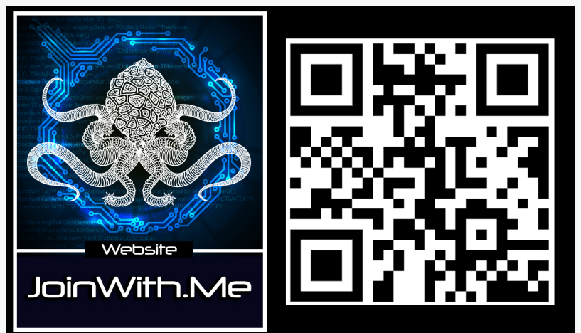
JoinWith.Me QR code that connects to the video trailer