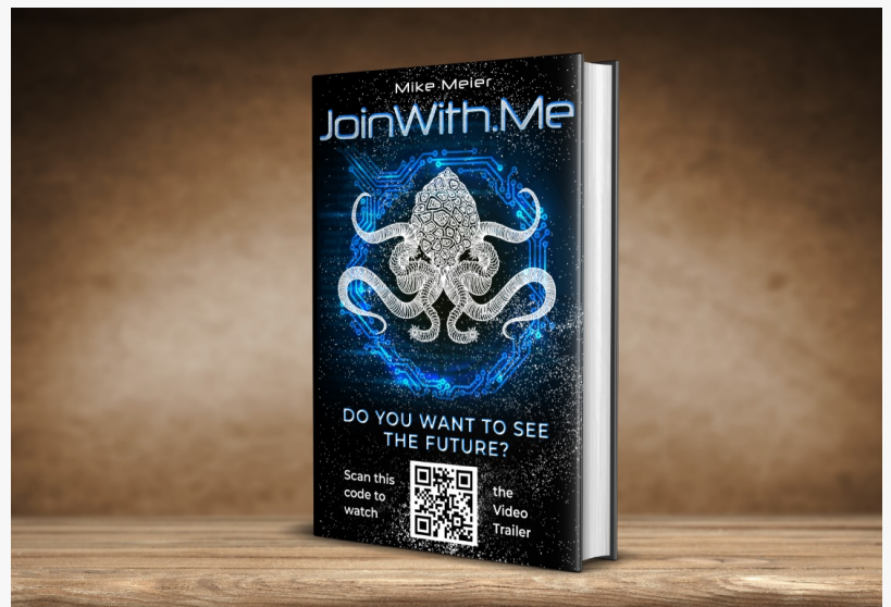
JoinWith.Me, book cover for hardcopy, with QR Code