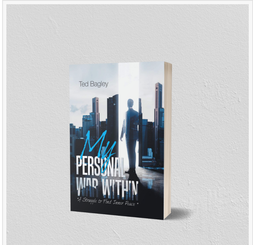
My Personal War Within