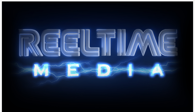
ReelTime Media Patent