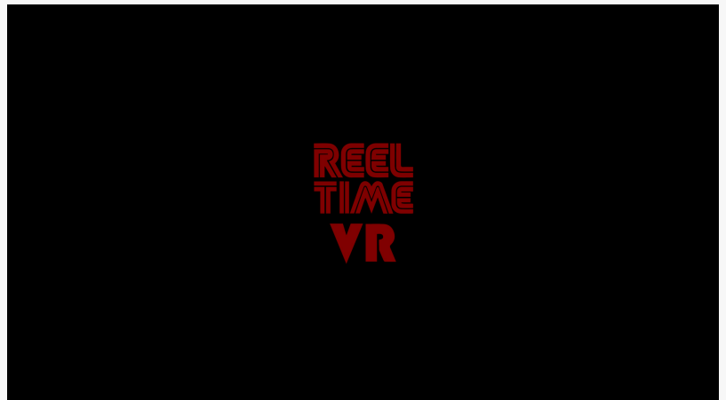
ReelTime VR USPTO