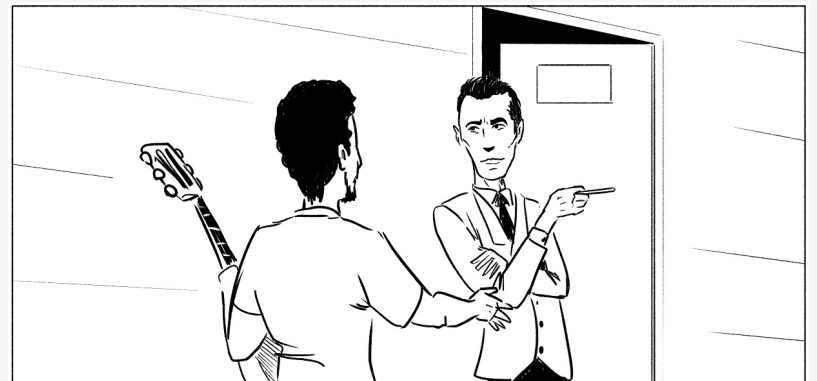
Storyboard image from The Love Hex or Nicest Flings in Mexico, Ramiro meets Agustin Lara