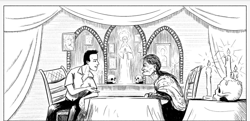
Storyboard image from The Love Hex or Nicest Flings in Mexico, the Town Witch, Curandera