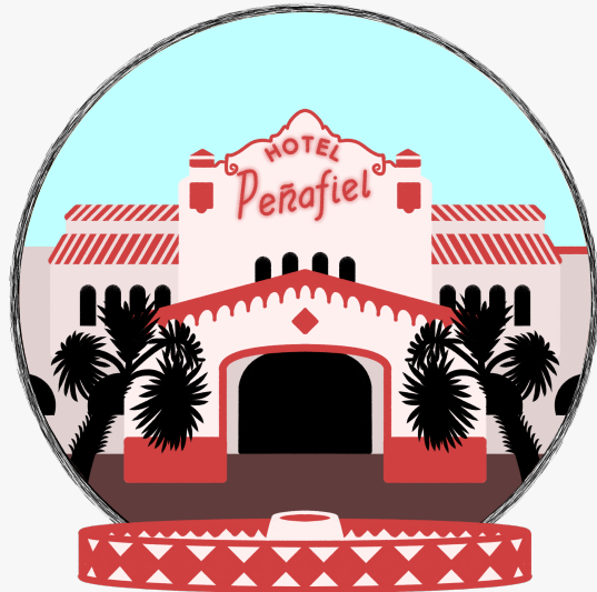
Logo of the screenplay "The Love Hex or Nicest Flings in Mexico"