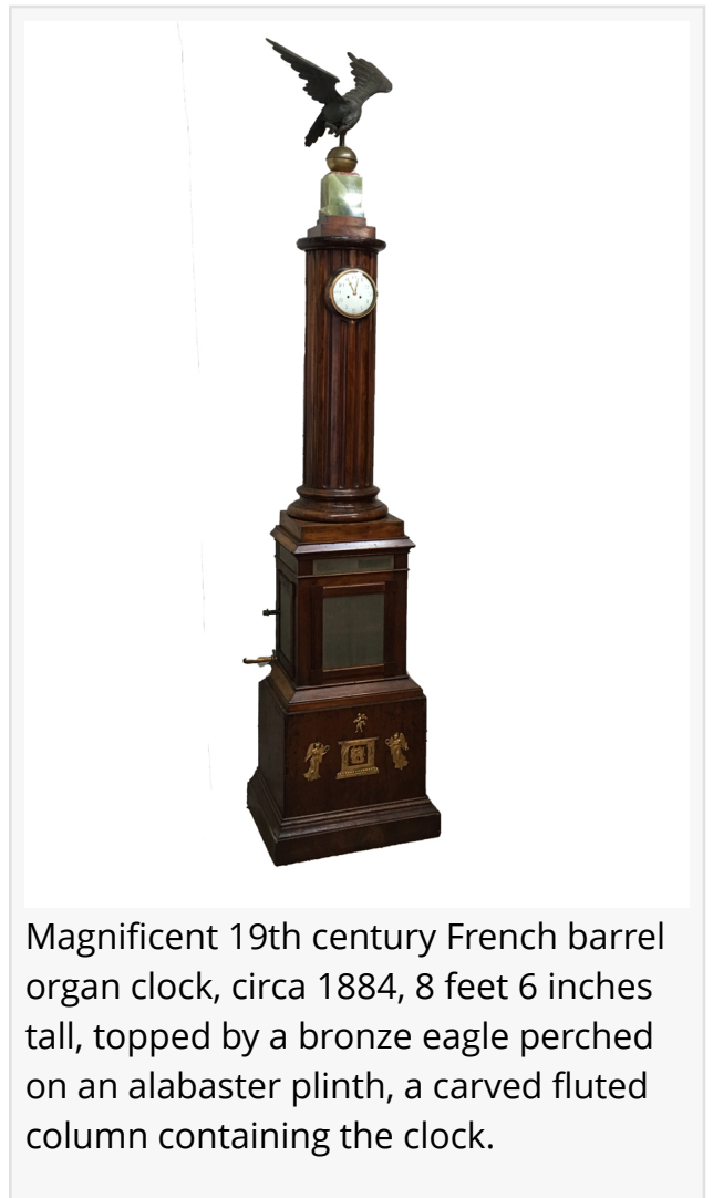
Magnificent 19th century French barrel organ clock, circa 1884, 8 feet 6 inches tall, topped by a bronze eagle perched on an alabaster plinth, a carved fluted column containing the clock.

Coin-ops will include an IQ tester, chewing gum and gumball coin-ops, and coin-ops titled The Target and The Races . Arcade games will feature Test Your Grip , Kicker Catcher , Rugger , 3-D Theatre , Personality Indicator , Power of Attraction , Penny Souvenir . Trade stimulators include