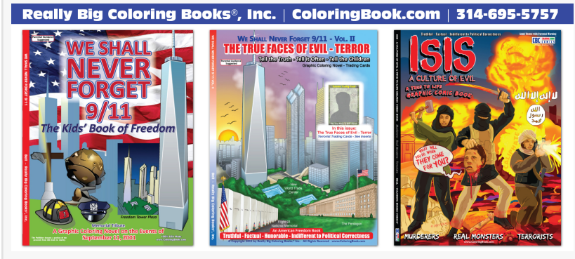
9/11 We Shall Never Forget - True Faces of Evil Terror - Anti-ISIS

Anti-Terror Coloring Books - Anti ISIS - True Faces of Evil - 9/11 Book