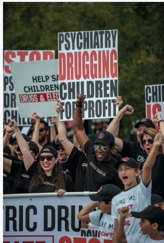
CCHR wants to know why psychiatric drugs for kids are being promoted so heavily to parents, teachers and health care professionals