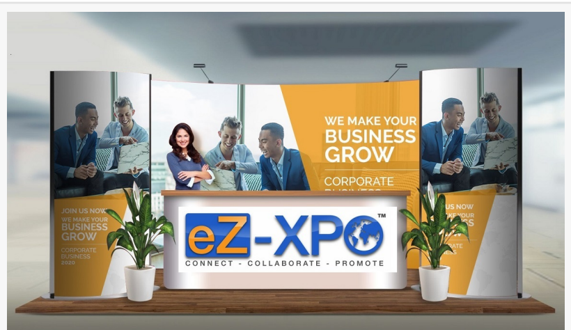
Virtual Booth for Trade Show, Classroom and Job Fair

Our game changer's All-in-1 Virtual Collaborative Network consists of virtual exhibitions, virtual job fairs, and virtual learning solutions for different industries and industry leaders such as MPI/DFW, New York Life, MetaStock, Space Conference/AAll, Boeing, Raytheon, Sawgrass Technologies, America SBDC, European Space Exploration Expo and Asian Business of Silicon Valley over the last four years. We are currently collaborating with CSPA, SIPA, ICO Accelerator Network, Cannabis Summit Network, Government Blockchain Association (GBA), NAA Rider Association, and Cybersecurity Association (UK) for their expo and conferences as well. eZ-Xpo