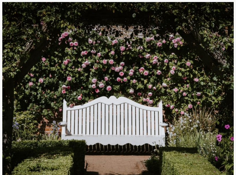
A beautiful living wall