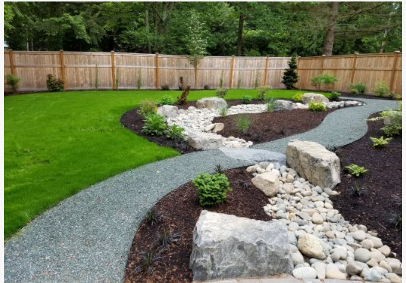
Example of a French Drain and Dry Creek Bed used in Landscaping

If you have a rocky slope or just a rocky terrain in general then this idea is for you! Rather than fight it, why not use it to your advantage? Rocks can make a great addition to a landscape design . You can try a rock