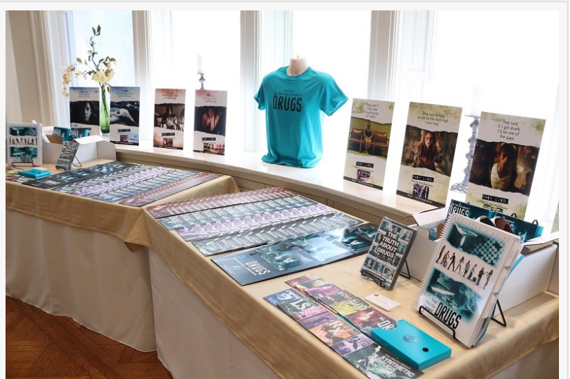
The “Truth About Drugs” materials all available online and hard copies can be ordered.

The Foundation for a Drug-Free World is a nonprofit public benefit corporation that empowers youth and adults with factual information about drugs so they can make informed decisions and live drug-free.