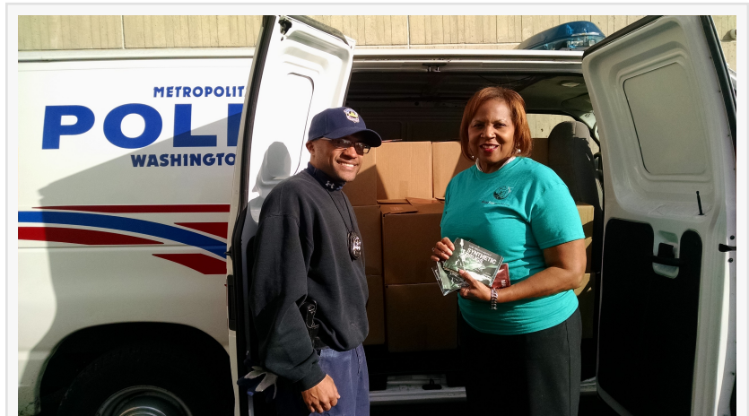
Foundation for a Drug-Free World volunteer sharing booklets with a DC Metropolitan police officer prior to COVID-19.

abuse statistics in the US, experts have noted that drug overdoses were going up prior to COVID-19.