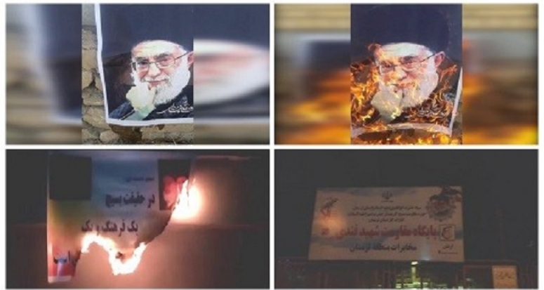
Tehran, Ahvaz, and Khorramabad - Torching Khamenei and Qassem Soleimani's banners – July 30, 2020