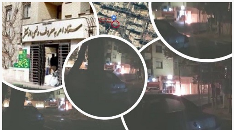
Tehran- Torching the entrance to the center of repression – July 30, 2020