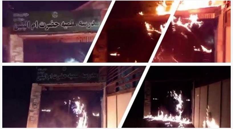
Karaj – Torching terrorist recruiting and training center

This press release can be viewed online at: https://www.einpresswire.com/article/523901660