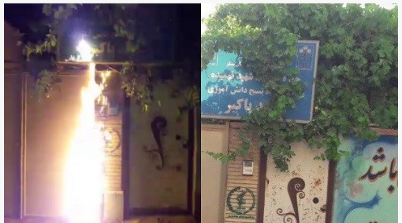
Sonqor – Targeting the repressive Bassij center – August, 2020