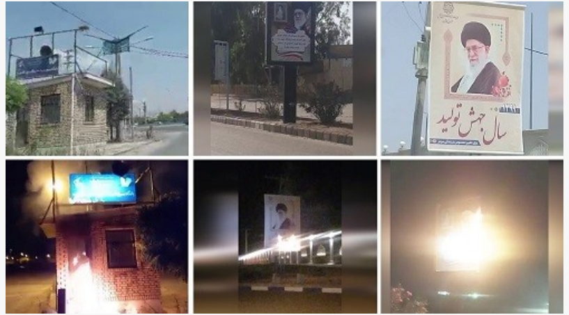
Karaj, Javanrud, Zahedan and Kashan – Targeting the entrance of the repressive Bassij center, and torching Khamenei's banner – August, 2020