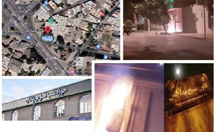
Neyshabur – Torching terrorist recruiting and training center Shahinshahr – Torching the repressive Basij center – August, 2020

/EINPresswire.com/ -- In recent days, defiant youth have targeted regime centers responsible for repressing the public, plundering the nation's resources, and exporting terrorism. These activities took place in Tehran and various cities, including Khorramabad, Zahedan, Shahinshahr, Karaj, Hormozgan, Neyshabur, Sonqor, Mashhad, Shahr-e-Rey, Gorgan, Isfahan, Ahvaz, Javanrud, Kashan, Masjed Soleyman and Shiraz.