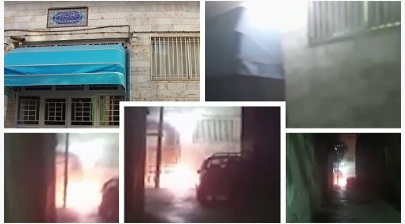
Mashhad- Setting fire to recruiting and training terrorism center