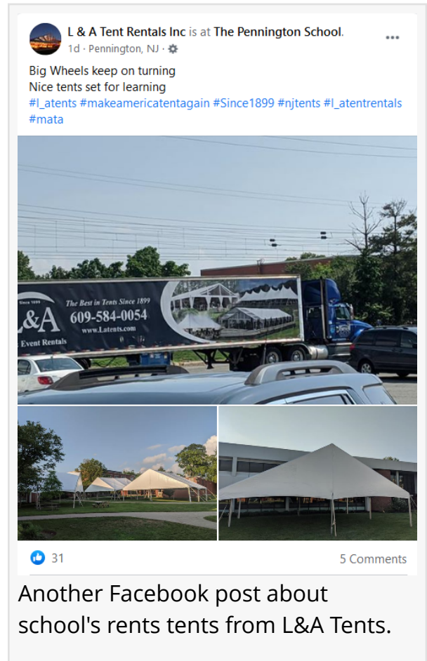
Another Facebook post about school's rents tents from L&A Tents.

This press release can be viewed online at: https://www.einpresswire.com/article/523942202