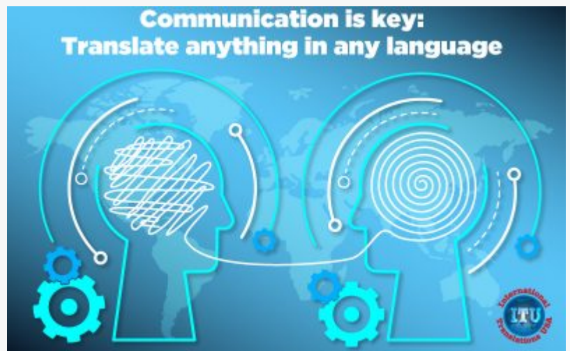
TRANSLATING INTO ANY LANGUAGE