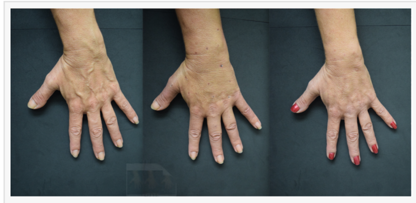
Before-three day later-end results

ENCINO, CALIFORNIA, US, August 14, 2020 /EINPresswire.com/ -- Women can take excellent care of their faces and necks using everything from facials, Botox, fillers, and lifts. But what happens when unsightly hand veins will still make a woman perceive a degree of the age-related esthetic vulnerability? Yes, seniority is unavoidable, showing it, however, optional!