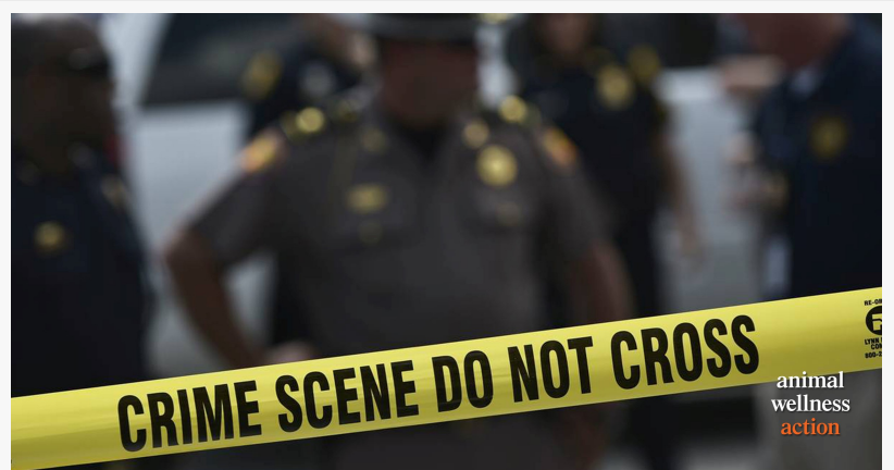
Animal Cruelty Enforcement (ACE) Act

WASHINGTON, DC, UNITED STATES, August 14, 2020 /EINPresswire.com/ -- In a major new federal legislative initiative, U.S. Reps. Joe Neguse, D-Colo., Matt Gaetz, R-Fla., Steve Cohen, D-Tenn., and Buddy Carter, R-Ga., introduced the Animal Cruelty Enforcement (ACE) Act, a bill they forged in cooperation with Animal Wellness Action and the Animal Wellness Foundation to step up federal action against perpetrators of malicious cruelty. The measure would create a new Animal Cruelty Crimes section within the U.S. Department of Justice (DOJ), housed within the Environment and Natural Resources Division.