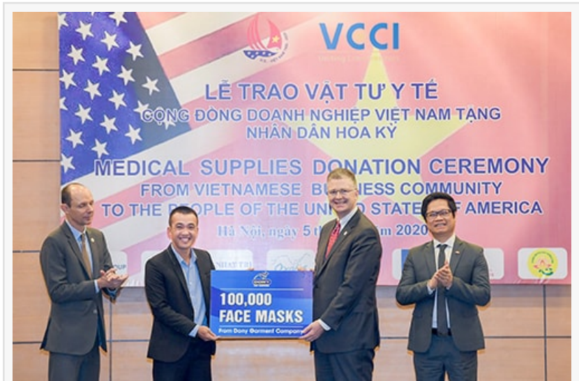
Dony Garment Company along with other Vietnamese enterprises donated medical supplies to the US

after you wash your hands. Soap and water or hand sanitizer are all good to wash your hands