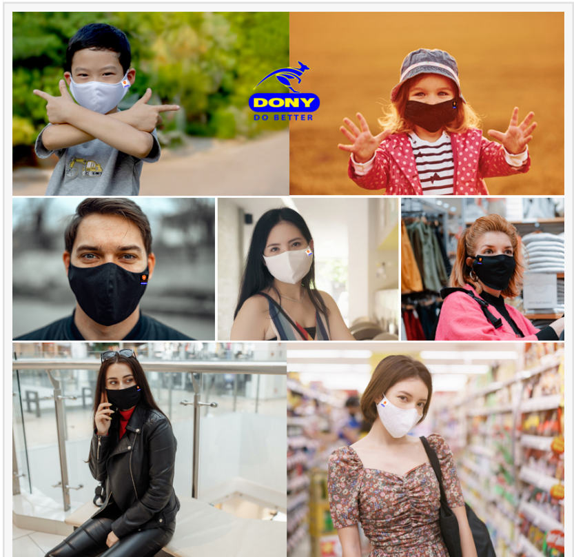
DONY MASK - premium antibacterial cloth face mask (washable, reusable) with CE, FDA, TUV Reach, DGA Certification

For hand-washing cloth masks, make sure you dry it thoroughly (under natural light in a clean space or using a dryer). After repeated use and washing, your cloth mask is prone to be torn and worn. If you have to throw a mask that can no longer be in use, store it separately in a garbage bag instead of having it direct contact with other items.