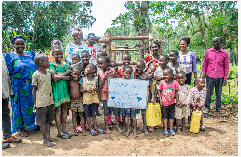
Wells of Life Ireland Water Well in Uganda

This press release can be viewed online at: https://www.einpresswire.com/article/524202935