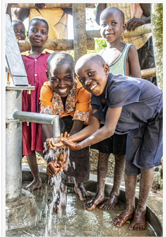
Children Gather at Water Well in Uganda