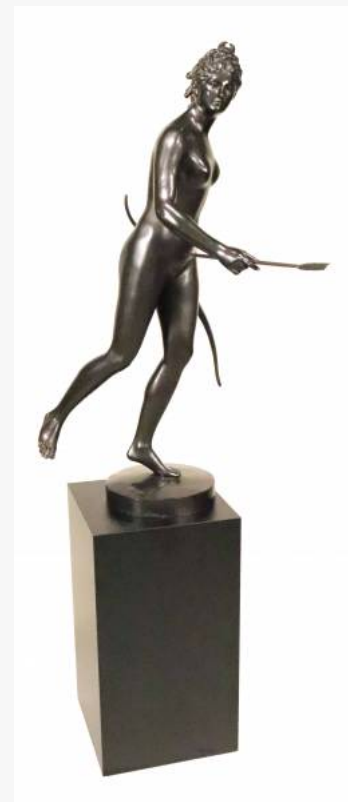
After Houdon, "Diana," Bronze