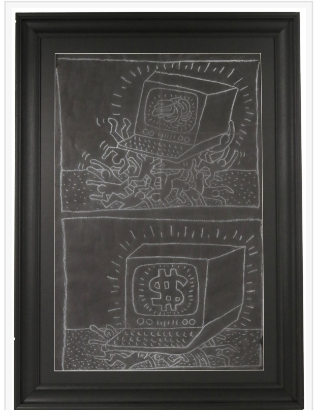
Keith Haring, Untitled, Chalk on Paper, Subway Drawing

A cast bronze fountain, entitled "Scherzo," depicting a young nude poised on a dolphin-supported base by the noted American artist, Harriet Whitney Frishmuth , is from a Frenchtown, New Jersey collection and leads the numerous pieces of sculpture. At nearly 4' tall, "Diana" comes from a different consignor, is after Jean-Antoine Houdon (French, 1741-1828) and could be the centerpiece of a successful bidder's garden room. Another notable consignment from the New