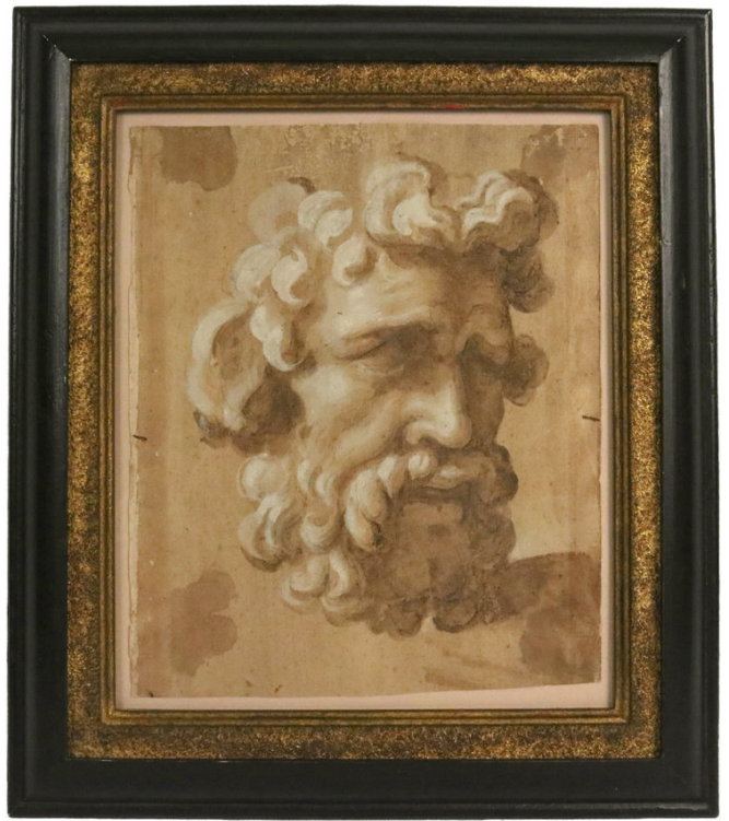
School of Annibale Carracci, Mixed Media on Paper, Study of a Head

This press release can be viewed online at: https://www.einpresswire.com/article/524276358