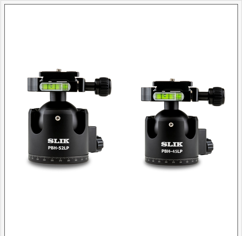
Slik PBH-52LP and 45LP low-profile professional ball heads

HUNTINGTON BEACH, CA, USA, August 25, 2020 /EINPresswire.com/ -- The new 52LP and smaller 45LP ball heads from SLIK introduce a convenient low-profile height ball head option that is both lightweight and sturdy. The machined aluminum craftsmanship makes these ball heads a great option for both traveling and professional photographers alike. The mechanics of these heads allow quick and convenient mobility with the utmost support. A tension lock knob allows selective micro adjustments and the independent pan knob allows precise panoramic placement for both photographers and videographers. Sporting twin U-shaped drop knobs allows effortless horizontal to vertical shifting.