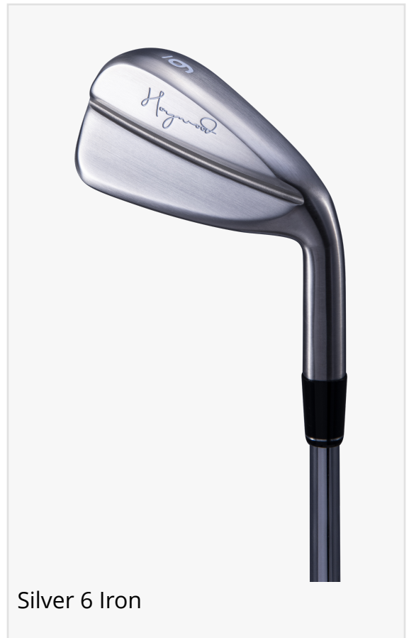
Silver 6 Iron