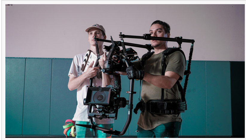
Voyage Pro is a video production company in Arizona. Phoenix content creation, talent, videography, photography. Video production studio based in Tempe, Arizona.

Voyage Pro also provides <u>models</u> for their video and photo shoots upon request. This ties everything together. "Customers will ship us items from all across the country and we will use our