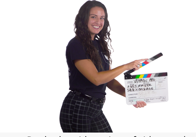
Voyage Pro had a wide variety of video producers in Phoenix Arizona for Video Production.

quickly and affordable. "Our team understands the urgency in these times so we guarantee a 7