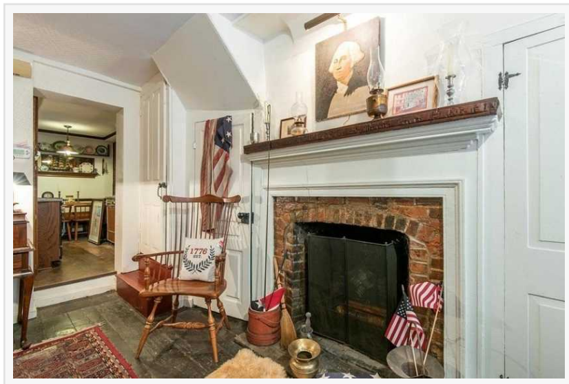
Furniture & Furnishings Included