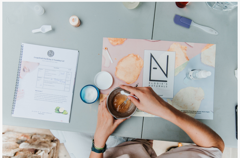
Healthy & Natural Skincare

Elodies Natural, an educational skincare chemistry workshop and clean beauty products provider