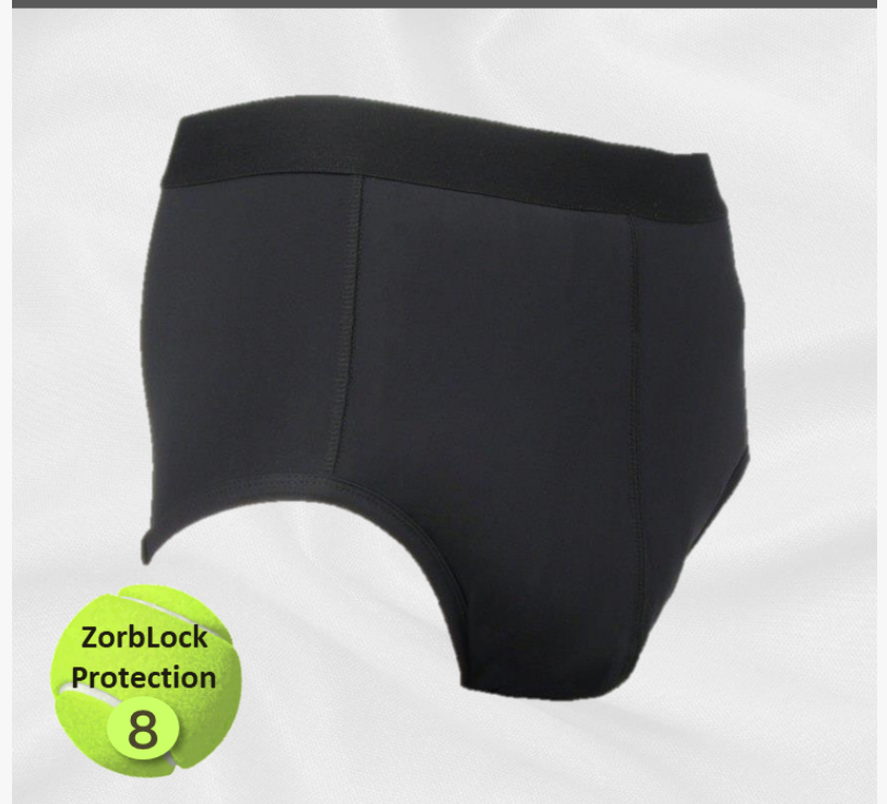
Zorbies Washable Incontinence SportsWear Brief