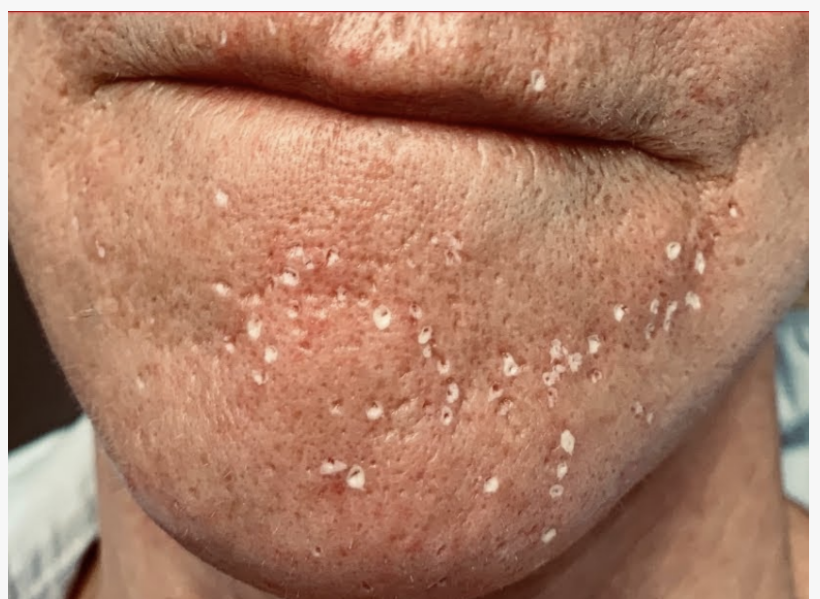
TCA CROSS Technique for Ice Pick Acne Scars

RFM uses multiple microscopic needles to penetrate the skin and then apply heat to the lower layers of the dermis. This heat causes coagulation when temperatures reach 65-70 degrees celsius. At that temperature, there is collagen remodeling, collagen, elastin, and hyaluronic acid formation. This all leads to improved appearance of the acne scars.