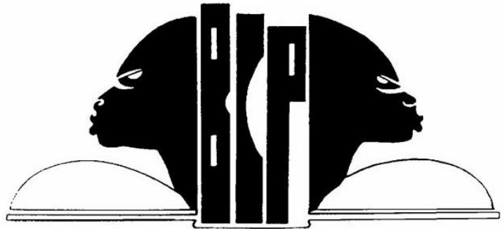
Black Classic Press

A native of Trinidad, Martin introduced a generation of students and others to Marcus Garvey. His meticulous work solidified Garvey's importance to Pan-African history, the Civil Rights Movement, Black Power and African liberation movements around the world. Martin was one of the earliest scholars to view Garvey's legacy as a lasting testimony in the struggles of Black diasporic people.