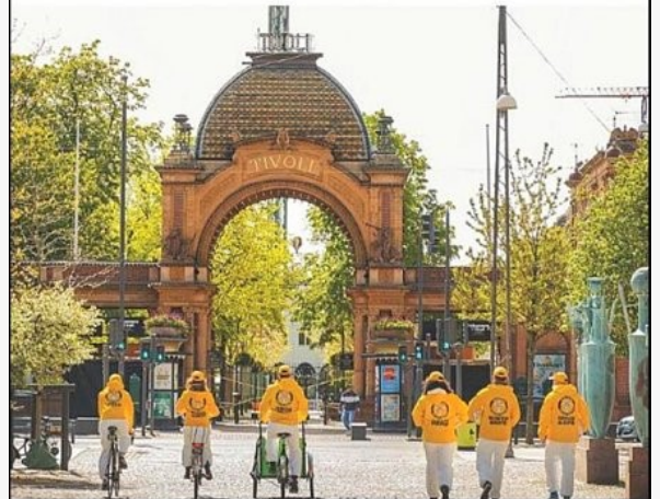
We Can Lift This World While Quarantined

“We Can Lift This World While Quarantined”: Scientology and the 2020 Pandemic