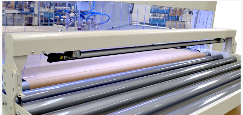
Diode reader bar on the Superfici America Mini Plus reads parts entering the cabin for precise spraying of the parts on the belt.