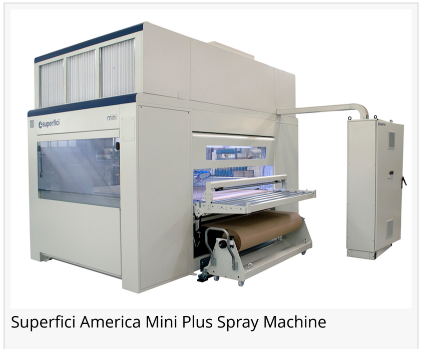
Superfici America Mini Plus Spray Machine