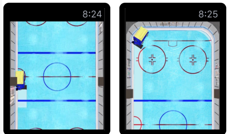
Zamboni® Watch 2.0 screenshots