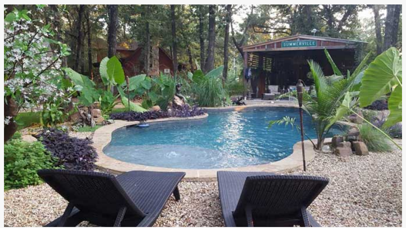
Backyard Oasis from Texoma Pools for a much-needed COVID-19 break

Texoma Country Pool and Spas offers a warranty station for all major brands, and the company's retail store is stocked with all the chemicals a pool or spa owner could need.