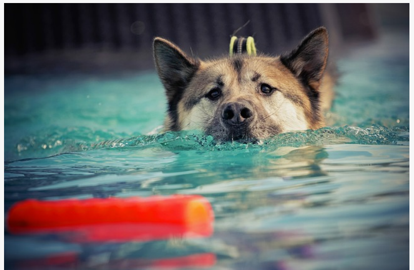
Even Dogs Need a Break from COVID-19

Texoma Country Pool and Spas turns backyards into a much needed paradise during COVID-19.