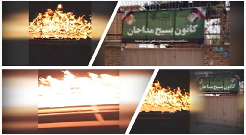
2- Iran - Shahinshahr – Torching the sign for the unpopular Basij center- August 18, 2020