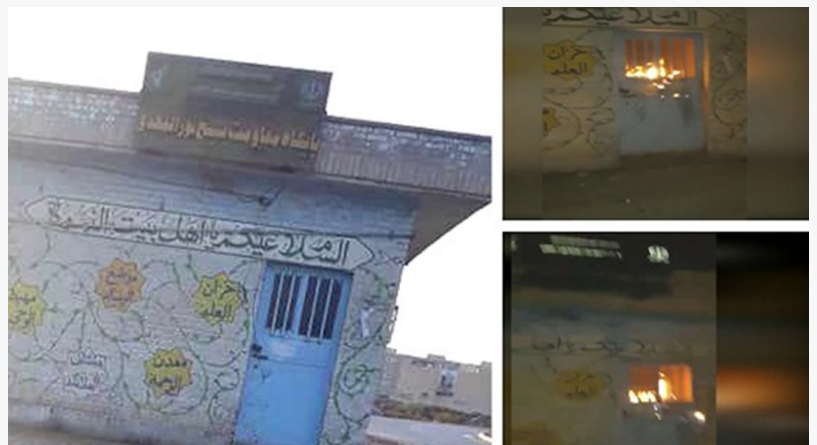
3- Iran - Ahvaz – Torching the entrance to the IRGC center, tasked with repressing women – August 2020