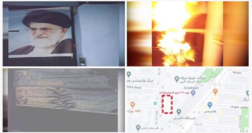
1- Iran - Karaj – Torching the repressive Basij center, setting alight Khamenei's banner – August 2020

PARIS, FRANCE, August 25, 2020 /EINPresswire.com/ -- Despite the clerical regime's repressive measures to create an atmosphere of terror in society because it fears the eruption of an uprising, in recent days defiant youth, targeted the repressive IRGC and Basij forces , as well as the terrorist recruitment and training center of the regime in various cities, including Karaj, Zahedan, Mashhad, Shahinshahr, Ahvaz, Khorramabad, Mahshahr, and Galikesh.