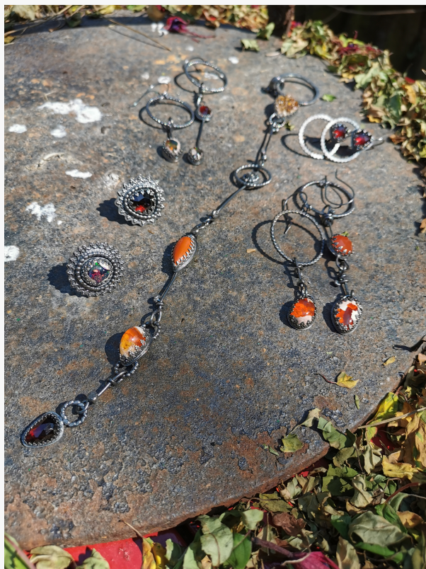
Fire And Fae - The Fire Collection

This press release can be viewed online at: https://www.einpresswire.com/article/524804786