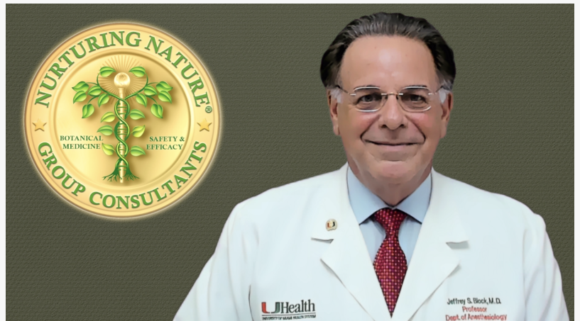
Nurturing Nature Studio