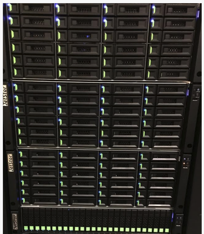
JetStor storage installed onsite at a major customer

The JetStor XN8012R 2U NAS and JetStor 824iXD platforms are designed for enterprises of all sizes that demand storage that is robust, blazingly fast, and yet economical. “AC&NC’s arrays have always been popular with media and entertainment,” said Gene Leyzarovich, president of AC&NC, “but by partnering with axle ai, we’re now offering the industry a next-generation value proposition. Our bundled solutions offer full control and management over media stores ranging from small libraries to massive troves, all with unequalled simplicity. Moreover, all content is rapidly available via remote access, which is critical for