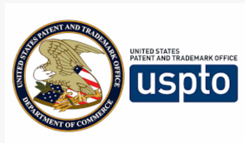
USPTO ReelTime VR Patent